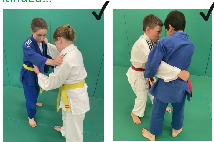
Figure 2 – Examples of Permitted Grips