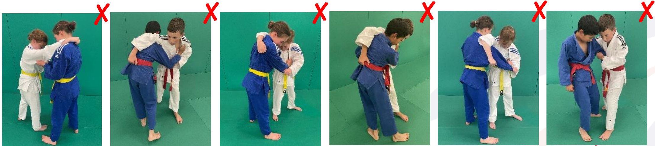
Figure 1 – Examples of Prohibited Over the Shoulder Grips

Exception: Where an athlete takes a waist grip, their opponent may then take a grip past the shoulder and down or across the back. At no point can a grip around the neck or back of the collar be taken.