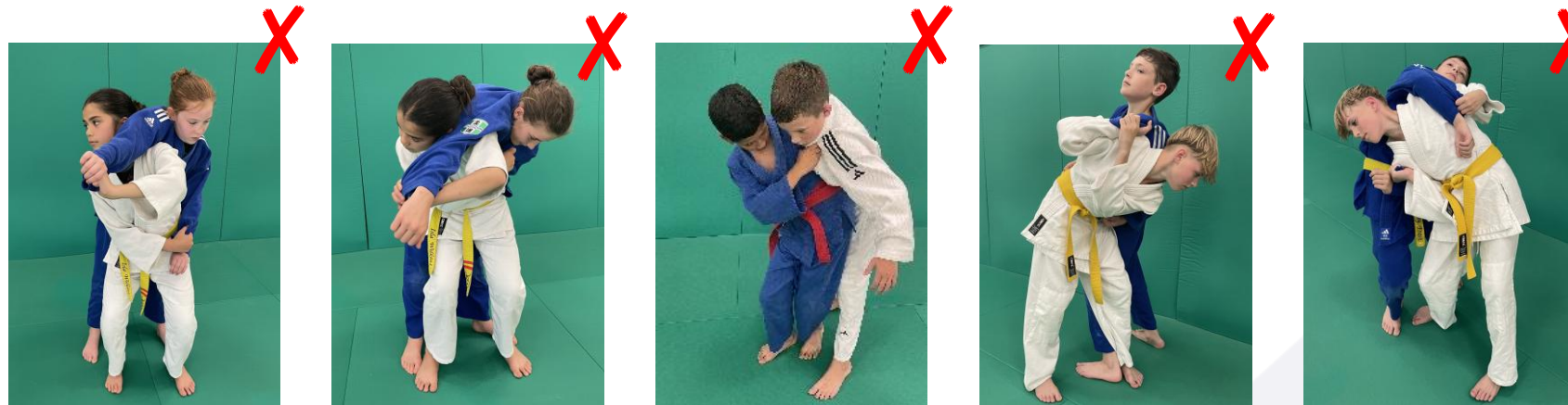
Figure 3 – Examples of Prohibited Throws with Double-Sleeve or Reverse Grips