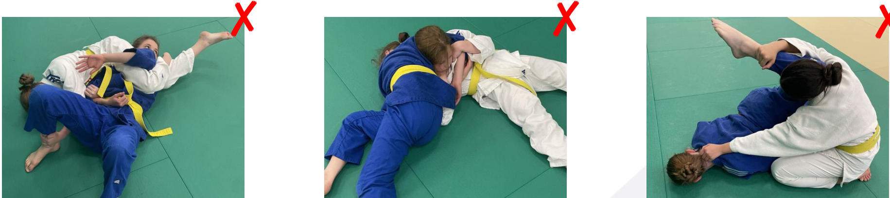
Figure 5 – Examples of Prohibited Osaekomi-Waza / Newaza