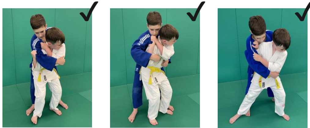
Figure 4 – Examples of Allowed Throws with Same-Side Grips