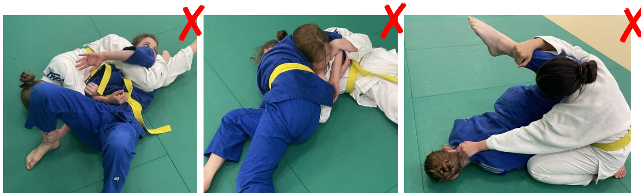
Figure 5 – Examples of Prohibited Osaekomi-Waza / Newaza