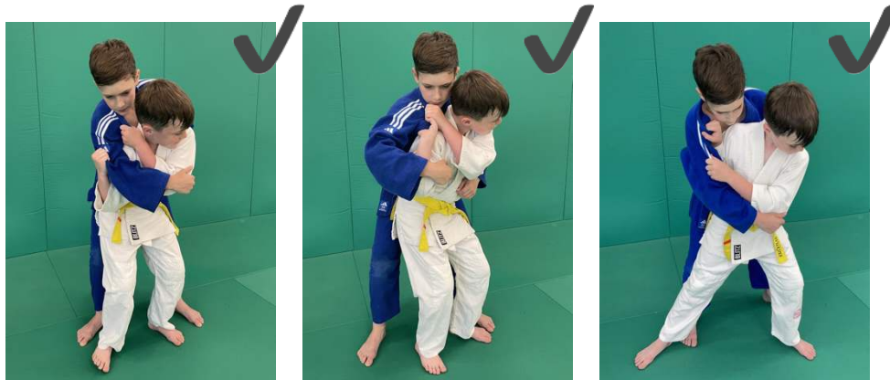
Figure 4 – Examples of Allowed Throws with Same-Side Grips