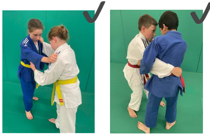
Figure 2 – Examples of Permitted Grips