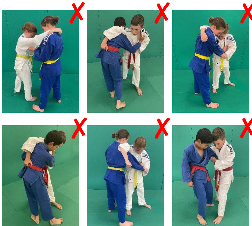
Figure 1 – Examples of Prohibited Over the Shoulder Grips

Exception: Where an athlete takes a waist grip, their opponent may then take a grip past the shoulder and down or across the back. At no point can a grip around the neck or back of the collar be taken.