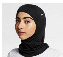
Nike Pro Hijab

Neck coverings approved in all categories, Nike and Adidas only