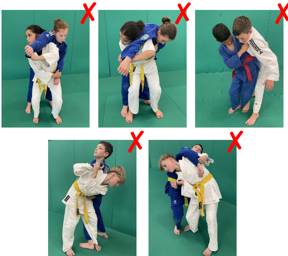
Figure 3 – Examples of Prohibited Throws with Double-Sleeve or Reverse Grips

Taking and throwing with same-side grips is permitted, allowing cross-grip variations of techniques such as seoi-nage and tai-otoshi (see Figure 4).