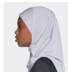
Adidas Sport Hijab