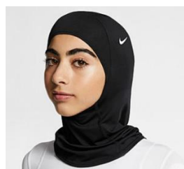
Nike Pro Hijab

Neck coverings approved in all categories, Nike and Adidas only