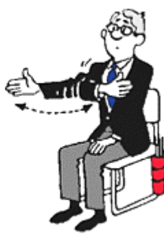
OUTSIDE ⇔ JOGAI