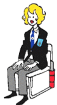
JUDGE NORMAL POSITION