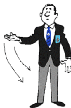
TO CALL THE DOCTOR