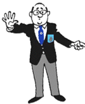
5 SECONDS IN DANGER ZONE