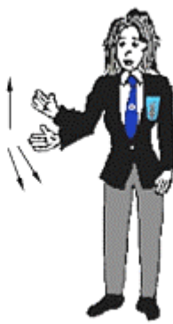
SIT DOWN ⇔ STAND UP