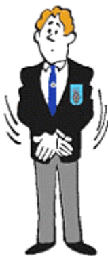
ADJUSTMENT OF JUDO GI