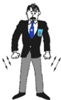
HAJIME ⇔ SORE-MADE