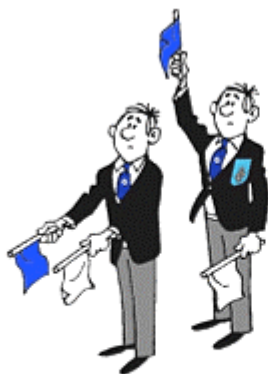
HANTEI (ending a "Golden Score" contest)