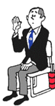
JUDGE'S OPINION DIFFERS