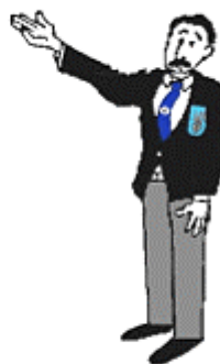
KACHI (winner in a normal contest)