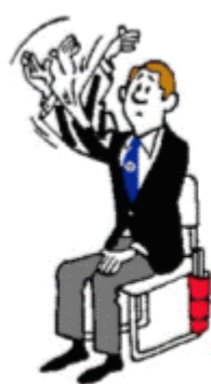
JUDGE CANCELLING NOT VALID