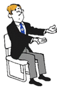
STAND UP MATE IN NEWAZA