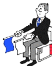
HANTEI SITUATION (ending a "Golden Score" contest)