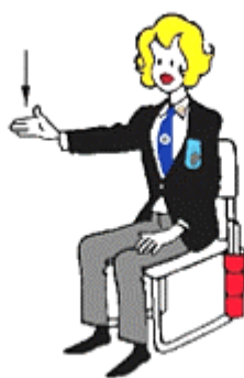
INSIDE ⇔ JONAI