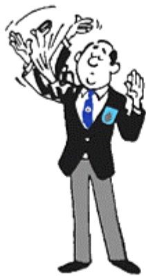
TO CANCEL EXPRESSED OPINION